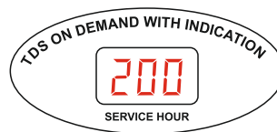
Remaining Service Hour Display